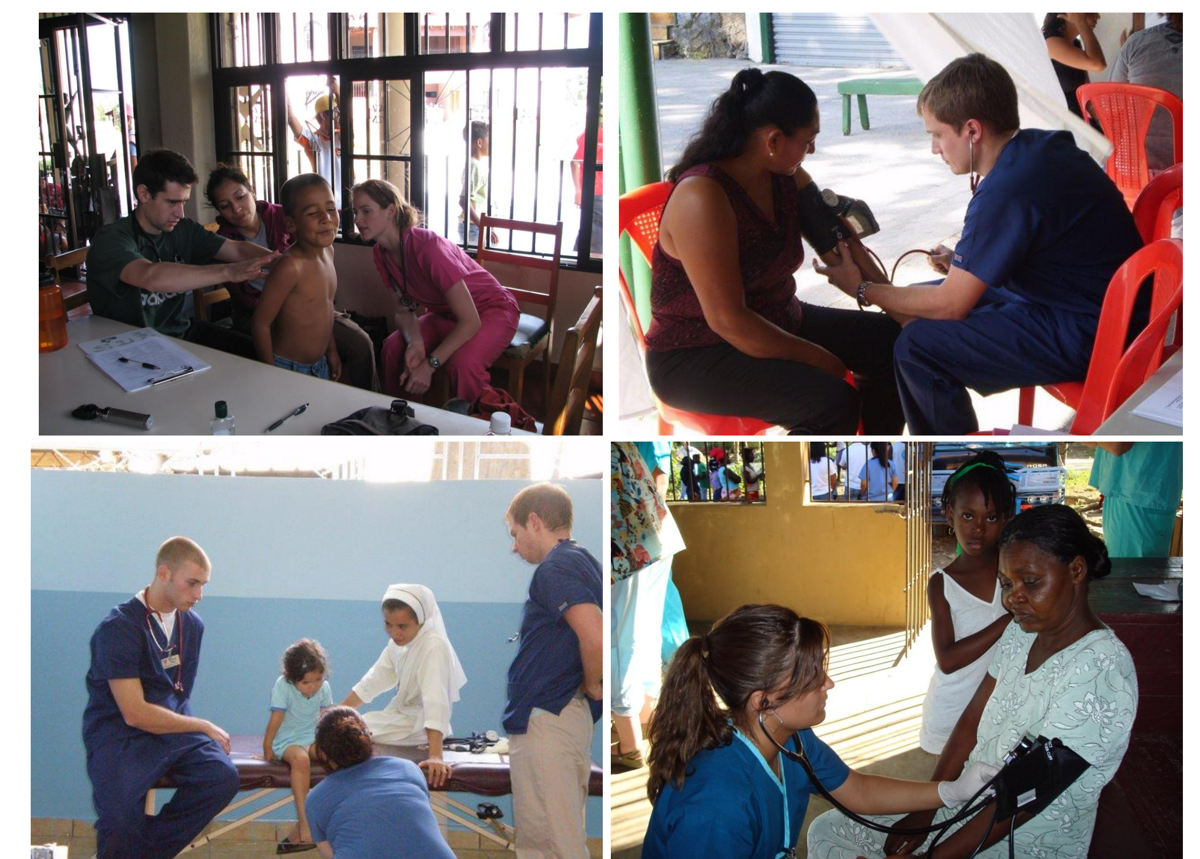
Medical students serving in VCOM international clinic locations