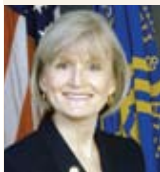
Mary Wakefield, PhD, RN

Mary Wakefield, PhD, RN, Administrator, Health Resources and Services Administration