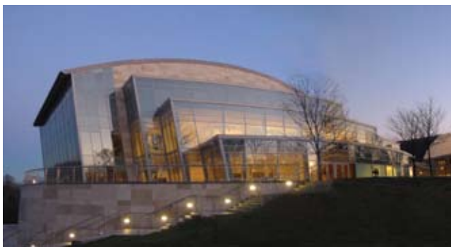
Strathmore Hall Arts Center, minutes from the Annual Meeting hotel, offers world-renowned, creative and diverse programming in its concert hall and education complex.